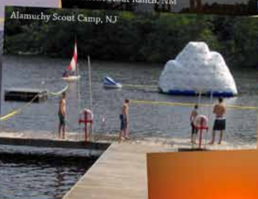
Alamuchy Scout Camp, NJ