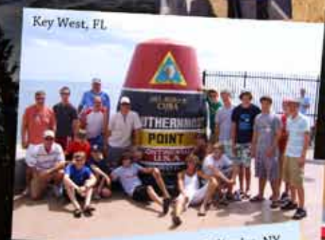
Key West, FL