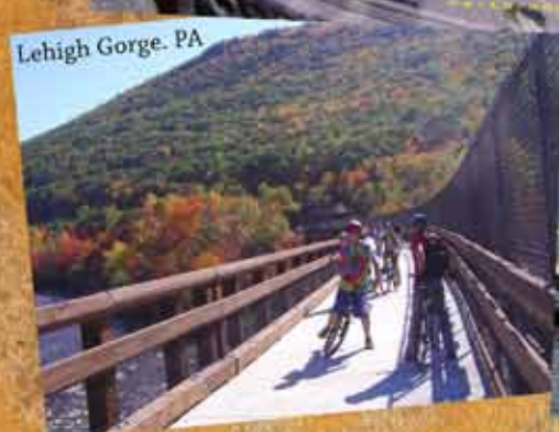
Lehigh Gorge, PA