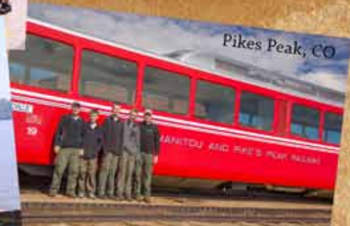
Pikes Peak, CO