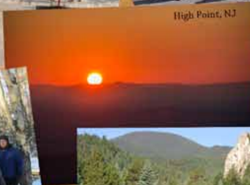
High Point, NJ