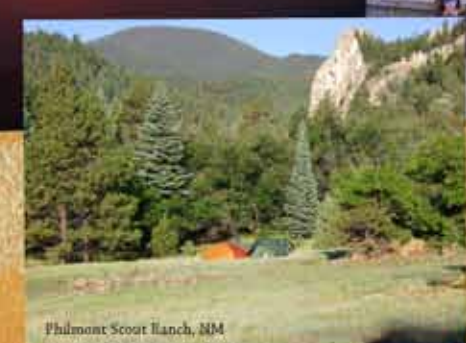
Philmont Scout Ranch, NM

A Scout is: Trustworthy Loyal Helpful Freindly Courteous Kind Obediant Cheerful Thrifty Brave Clean Reverent