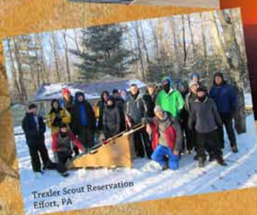
Trexler Scout Reservation Effort, PA