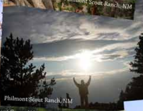
Philmont Scout Ranch, NM