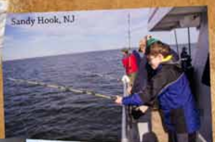
Sandy Hook, NJ