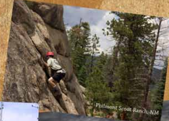
Philmont Scout Ranch, NM